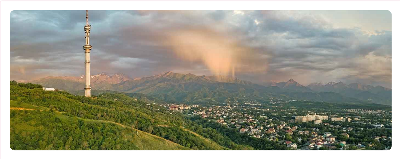
Day 3 | PANFIOV PARK & ZENKOV CATHEDRAL|KOKTOBE